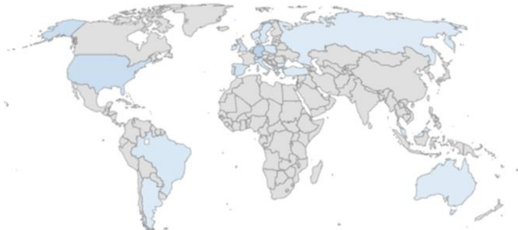
Figure 2 – Attendees' countries.