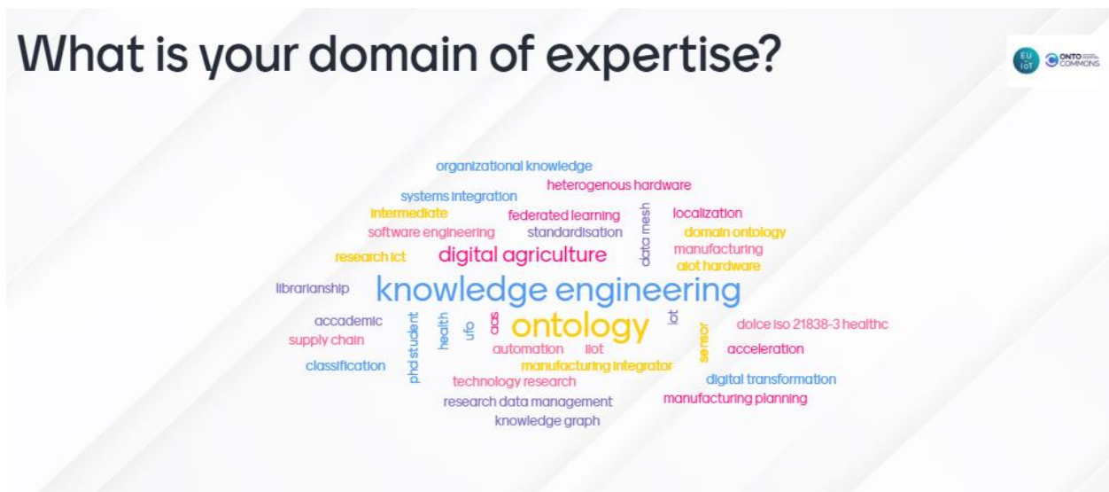
Figure 3 – Attendees’ inputs for the first question during the interactive session.